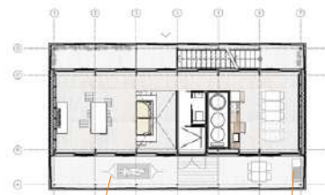
一层平面 约 114 平，室内 69 平